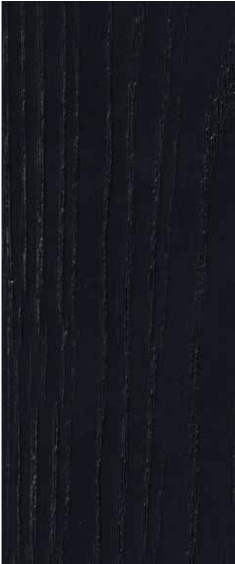
RAL 7021 – BLACK GREY