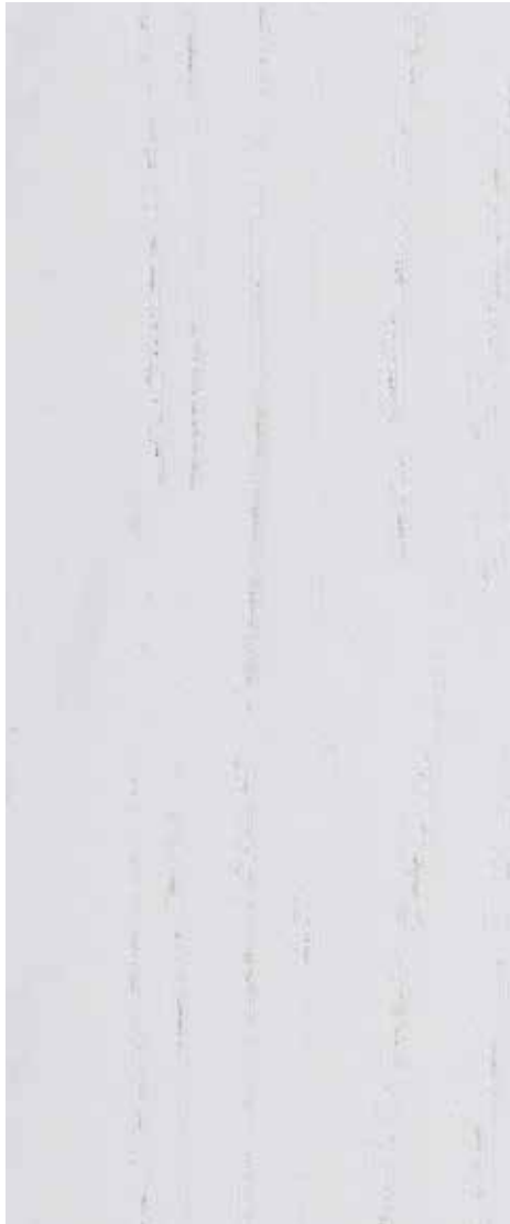
RAL 9003 – SIGNAL WHITE