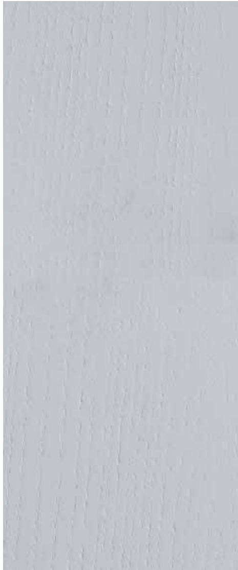
RAL 9018 – PAPYRUS WHITE