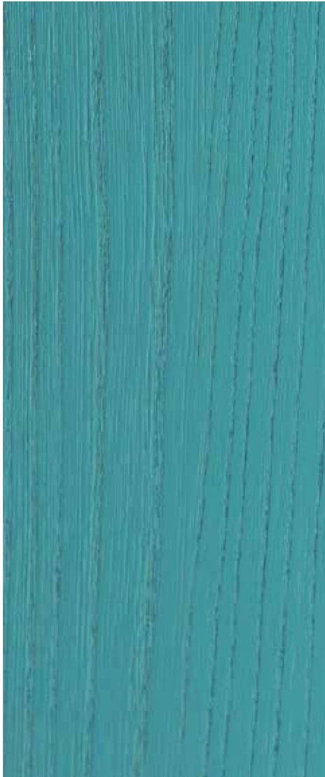
RAL 6034 – PASTEL TURQUOISE